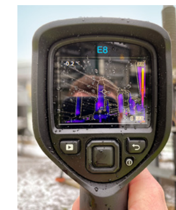
Example of an infrared examination of an outdoor termination showing no abnormalities.