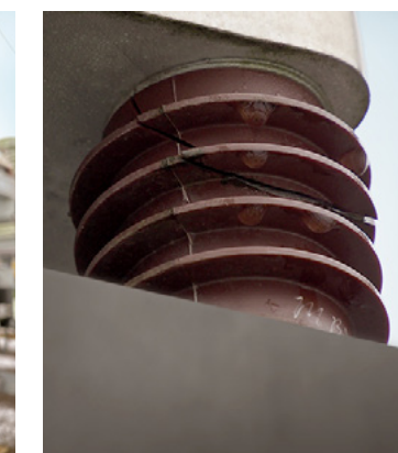
Example of a defective insulator below the adapter base plate of the outdoor termination discovered during the visual inspection.

The sheath inspection revealed what was presumed to be sheath fault, but this turned out to be earth fault on the outdoor termination of one phase. Brugg Cables recommended that the fibre optic cable outlets and hood sleeves causing the problem be repaired as a precaution.